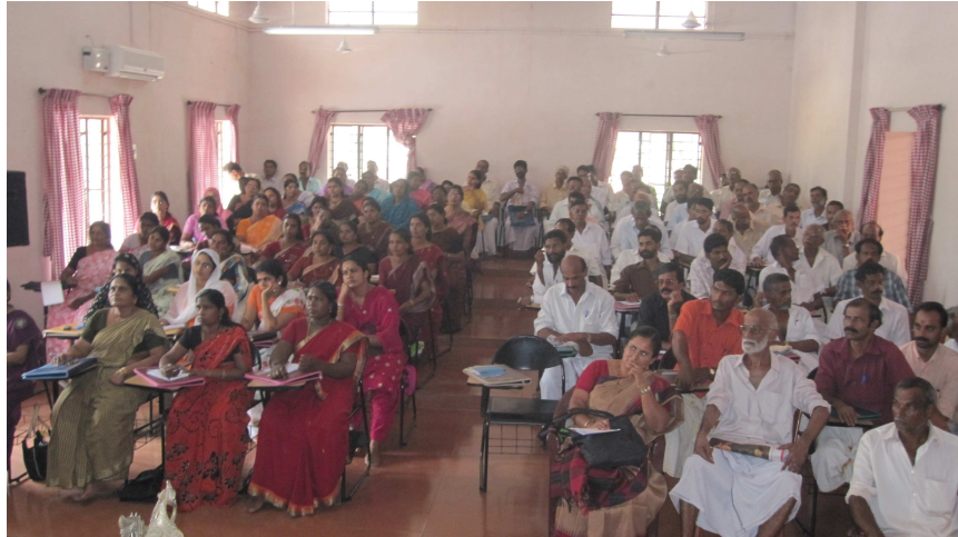
Plate 4: A glance of the attentive audience

This was followed by a demonstration of price forecasts made by the Centre, and its validation. The farmers were introduced to the sites of Kerala Agricultural University and the College of Horticulture for accessing the market intelligence inputs with out time delay.